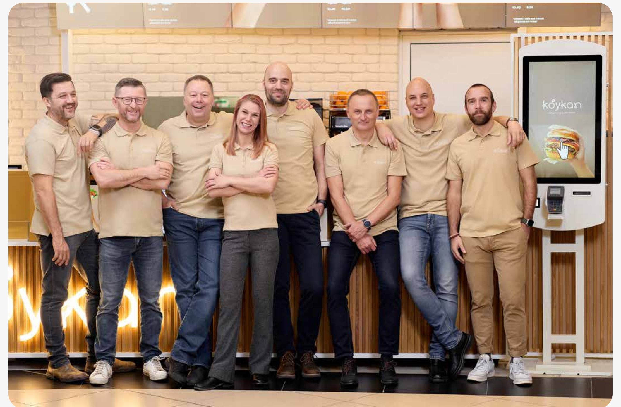
Koykan Management Team